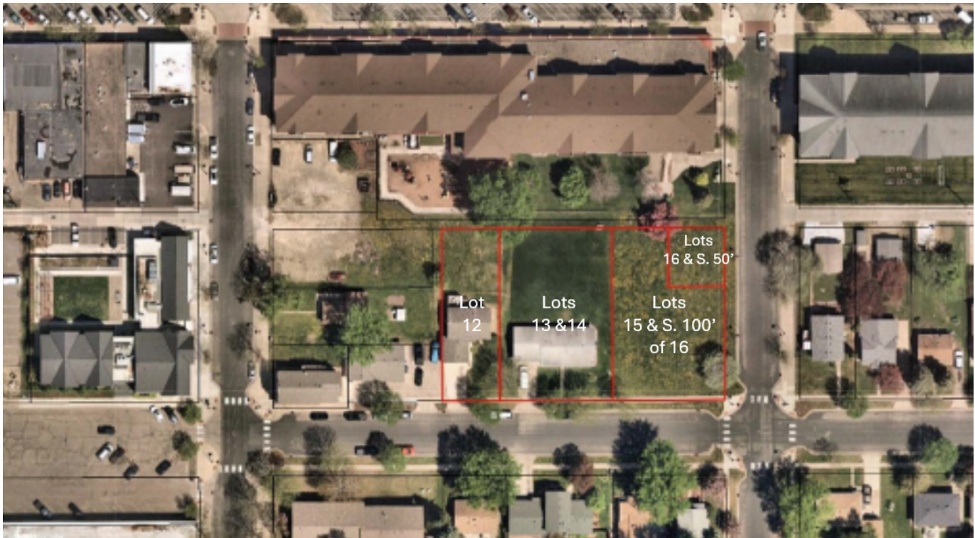
Exhibit 1 : Aerial Map of Lots 12–16, Block 47