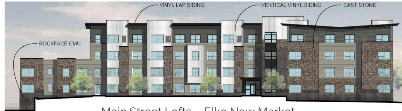
Main Street Lofts – Elko New Market