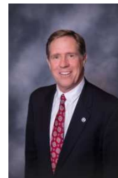
Mayor Kirt Briggs